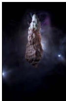
topographies of the unconscious IV: candied on the inside, 2011 C-type prints on Kodak Endura paper. 90 x 60cm. Unique Edition of 1 + 1 AP