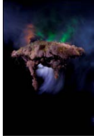
topographies of the unconscious II: Premature as evening falls, it calls to me, 2011 C-type prints on Kodak Endura paper. 90 x 60cm. Unique Edition of 1 + 1 AP