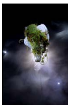
topographies of the unconscious V: conservatory, 2011 C-type prints on Kodak Endura paper. 90 x 60cm. Unique Edition of 1 + 1 AP