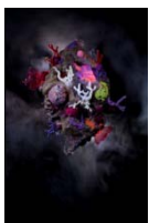
topographies of the unconscious VII: phantoms; under the lentisci of quiet, 2011 C-type prints on Kodak Endura paper. 90 x 60cm. Unique Edition of 1 + 1 AP