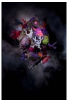
topographies of the unconscious VII: phantoms; under the lentisci of quiet, 2011 C-type prints on Kodak Endura paper. 90 x 60cm. Unique Edition of 1 + 1 AP

All of the images in the main gallery are available in small framed editions as presented in the alcove: C-type prints on Kodak Endura paper. 30 x 48cm. Ed. of 5 + 1 AP.