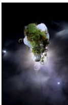
topographies of the unconscious V: conservatory, 2011 C-type prints on Kodak Endura paper. 90 x 60cm. Unique Edition of 1 + 1 AP