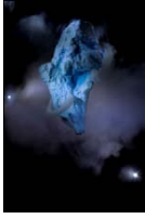
topographies of the unconscious I: forgotten wishes, 2011 C-type prints on Kodak Endura paper. 90 x 60cm. Unique Edition of 1 + 1 AP

Main Gallery clockwise from left to right