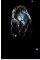
topographies of the unconscious III: You fell like rain in the dark abysses, 2011 C-type prints on Kodak Endura paper. 90 x 60cm. Unique Edition of 1 + 1 AP