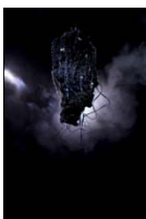
topographies of the unconscious VI: shadow which flees me, 2011 C-type prints on Kodak Endura paper. 90 x 60cm. Unique Edition of 1 + 1 AP