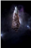
topographies of the unconscious IV: candied on the inside, 2011 C-type prints on Kodak Endura paper. 90 x 60cm. Unique Edition of 1 + 1 AP