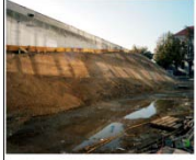
Construct 1, Krems Austria 2010 70 x 60 cm Edition of 3 + 1 AP