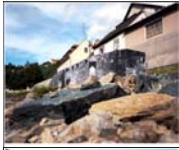
Fluss, Krems Austria, 2010 120 x 100 cm Edition of 3 + 1 AP

Main Gallery clockwise from left to right