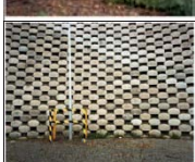
Construct 6, Praha Czech Republic 2010 70 x 60 cm Edition of 3 + 1 AP