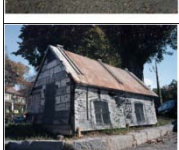
Kremser, Krems Austria, 2010 120 x 100 cm Edition of 3 + 1 AP