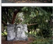
Stadtspark, Krems Austria 2010 120 x 100 cm Edition of 3 + 1 AP