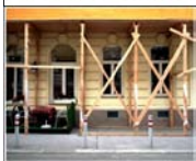
Construct 2, Wien Austria 2010 70 x 60 cm Edition of 3 + 1 AP