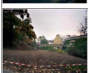
Construct 5, Praha Czech Republic 2010 70 x 60 cm Edition of 3 + 1 AP