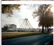
Construct 4, Dresden Germany 2010 70 x 60 cm Edition of 3 + 1 AP