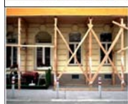
Construct 2, Wien Austria 2010 70 x 60 cm Edition of 3 + 1 AP