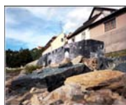
Fluss, Krems Austria, 2010 120 x 100 cm Edition of 3 + 1 AP

Main Gallery clockwise from left to right