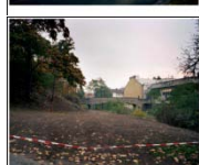
Construct 5, Praha Czech Republic 2010 70 x 60 cm Edition of 3 + 1 AP