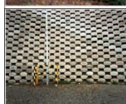
Construct 6, Praha Czech Republic 2010 70 x 60 cm Edition of 3 + 1 AP