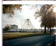
Construct 4, Dresden Germany 2010 70 x 60 cm Edition of 3 + 1 AP