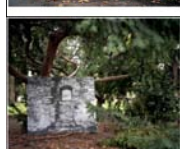
Stadtspark, Krems Austria 2010 120 x 100 cm Edition of 3 + 1 AP