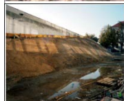
Construct 1, Krems Austria 2010 70 x 60 cm Edition of 3 + 1 AP