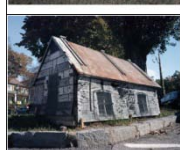
Kremser, Krems Austria, 2010 120 x 100 cm Edition of 3 + 1 AP