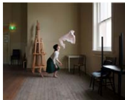
Untitled #3 2013 Archival inkjet print 50 x 62 cm Editions 5 + 2AP