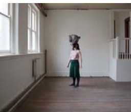
Untitled #5 2013 Archival inkjet print 50 x 60 cm Editions 5 + 2AP