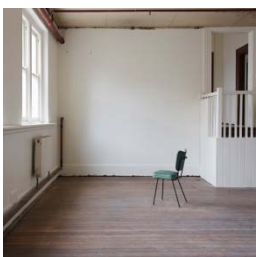
Untitled #6 2013 Archival inkjet print 50 x 50 cm Editions 5 + 2AP