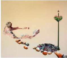
Kevin Chin Little Pieces (Bricks) , 2009