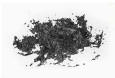
Simon Finn Liquid Mutation One, 2012 Charcoal on Paper 90 x 65 cm (75 x 50 cm unframed)