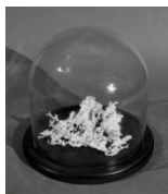
Simon Finn Static One, 2012 Synthetic Polymer 23 x 23.5 x 23.5 cm Edition of 3