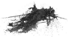
Simon Finn Liquid Surge, 2012 Charcoal on Paper 168 x 103 cm (150 x 85 cm unframed)