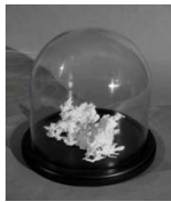
Simon Finn Static Three, 2012 Synthetic Polymer 23 x 23.5 x 23.5 cm Edition of 3