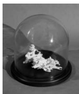
Simon Finn Static Two, 2012 Synthetic Polymer 23 x 23.5 x 23.5 cm Edition of 3 Available: Editions 2/3 and 3/3